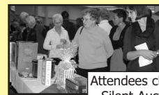
Attendees check out the Silent Auction items.

Pictures below are from Cultural Connect 2010 in Edmonton